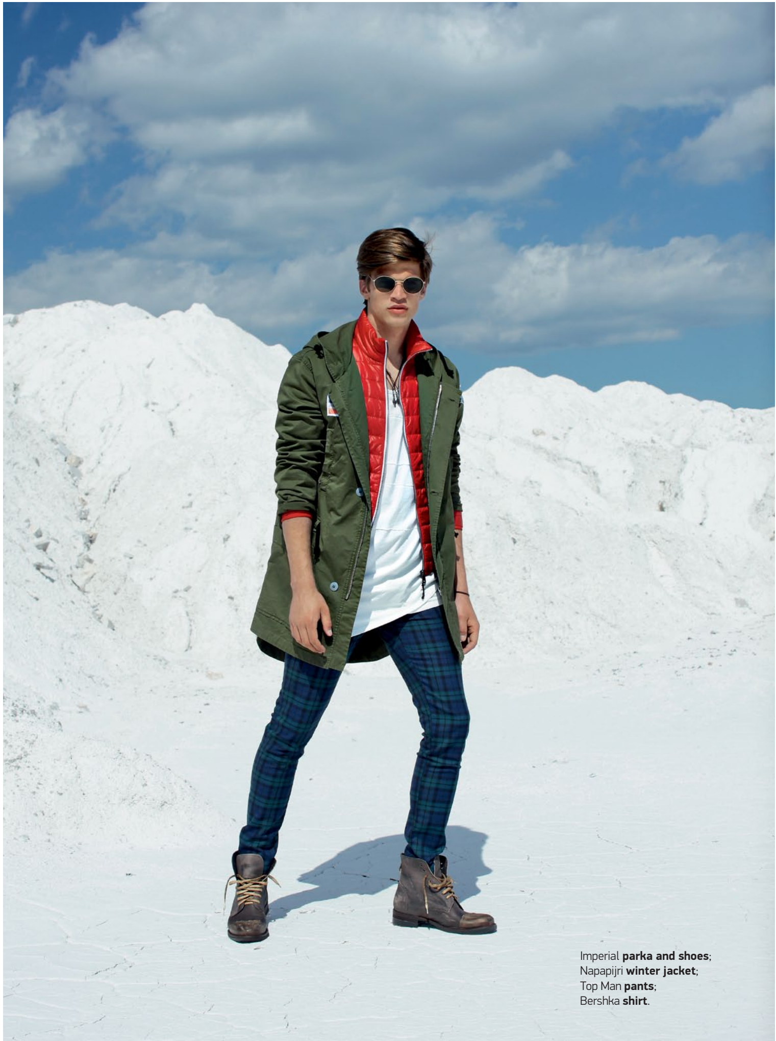
Imperial parka and shoes ; Napapijri winter jacket ; Top Man pants ; Bershka shirt .