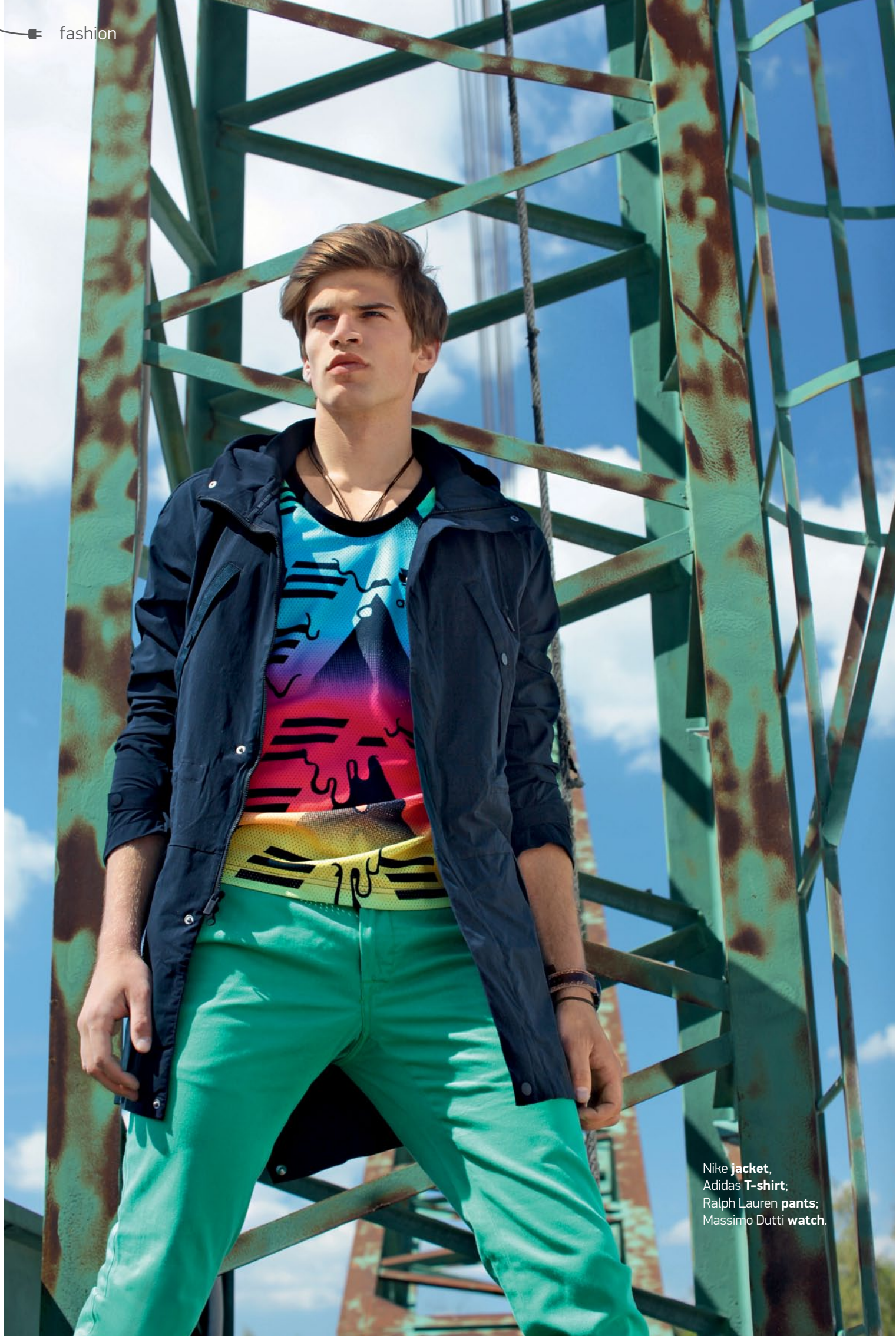
Nike jacket, Adidas T-shirt, Ralph Lauren pants; Massimo Dutti watch.