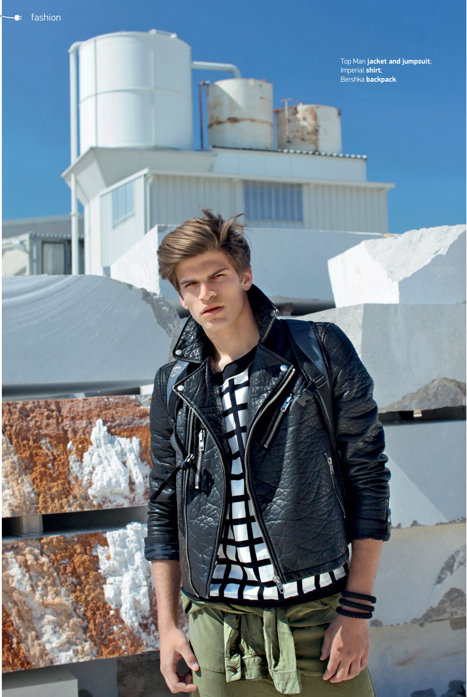
Top Man jacket and jumpsuit ; Imperial shirt ; Bershka backpack .