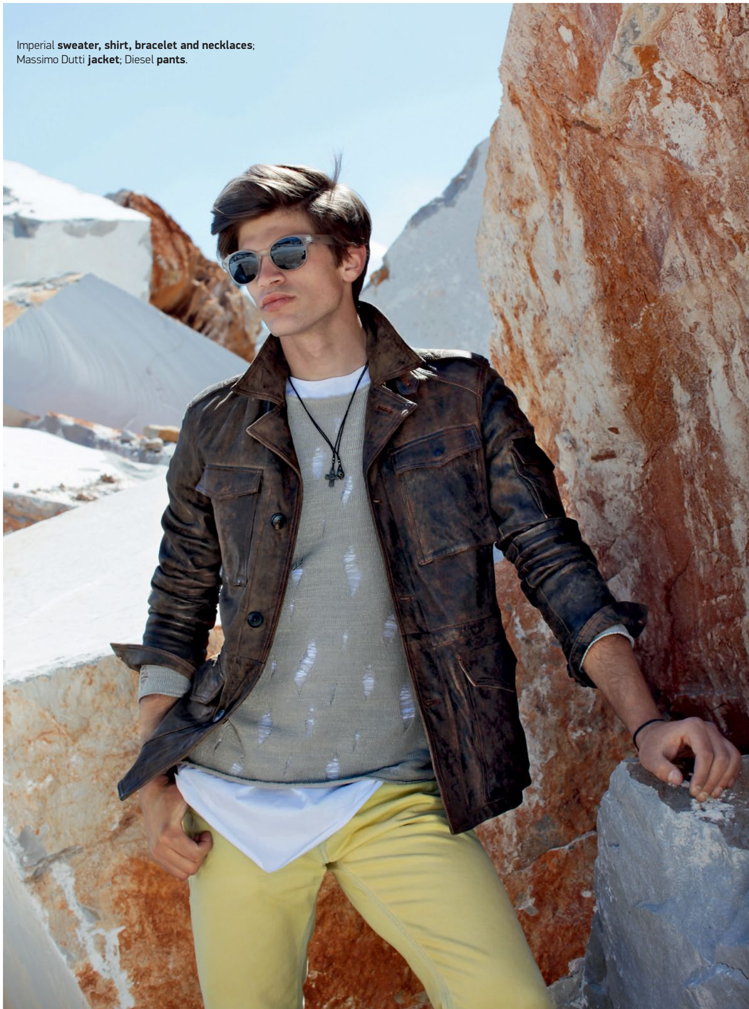
Imperial sweater, shirt, bracelet and necklaces; Massimo Dutti jacket; Diesel pants.