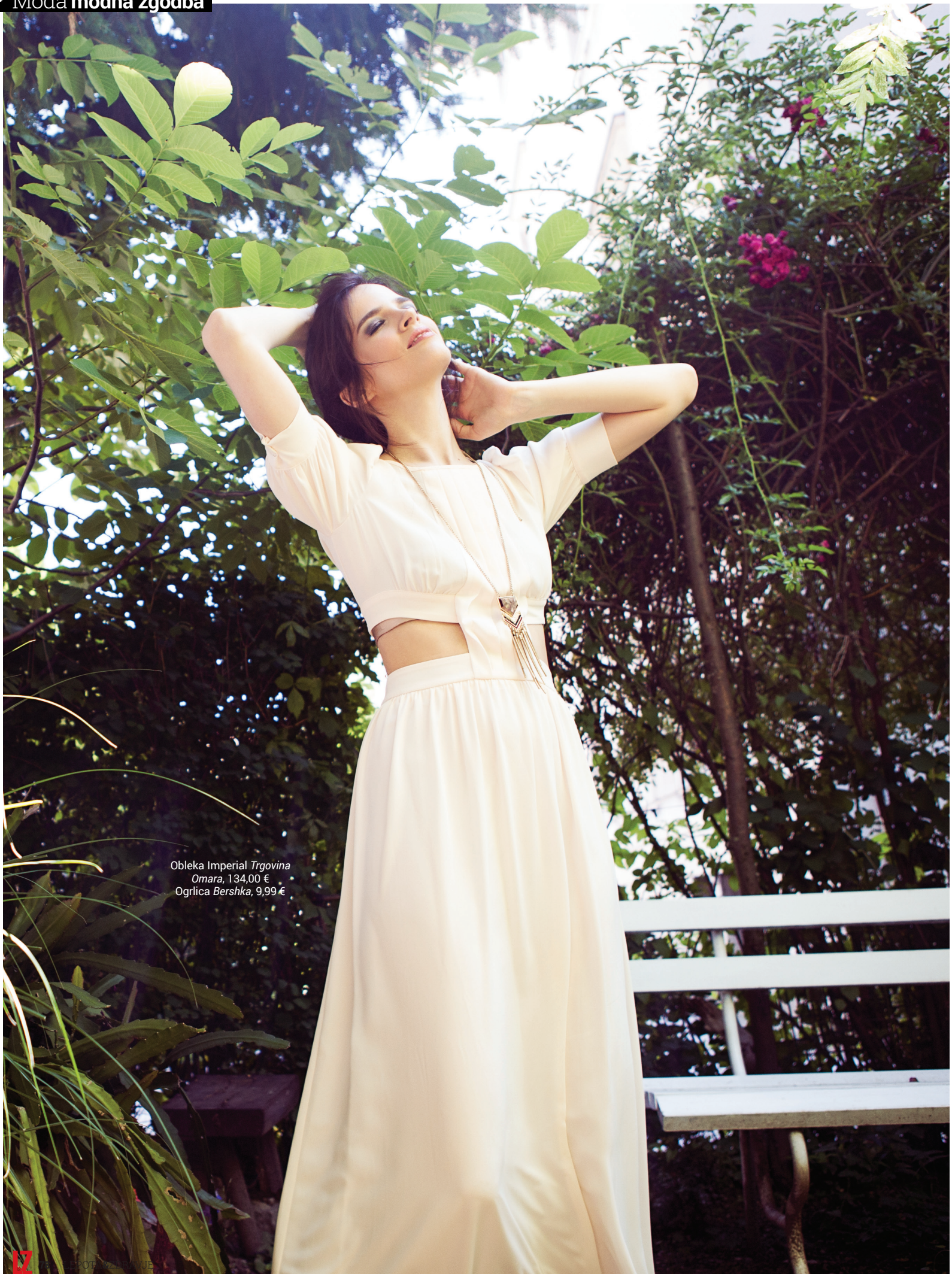
Obleka Imperial Trgovina Omara , 134,00 € Ogrlica Bershka , 9,99 €