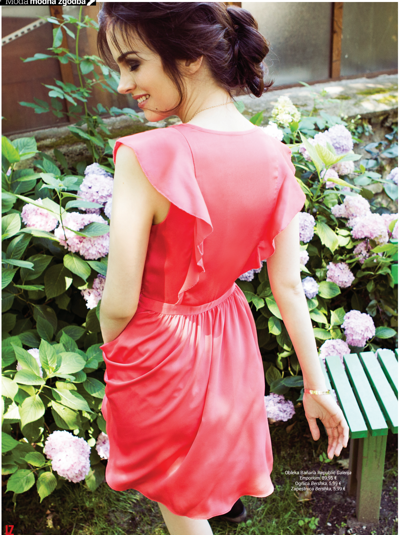
Obleka Banana Republic Galerija Emporium, 89,95 € Ogrlica Bershka, 5,99 € Zapestnica Bershka, 5,99 €